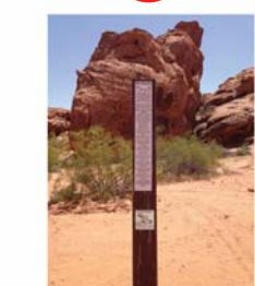
Petroglyphs 2 36.542431, -114.527469