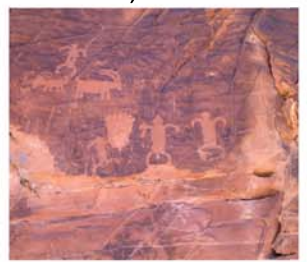
Petroglyphs Viewing 1 36.536645, -114.541584