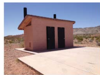
Second Restrooms on trail 36.559694, -114.550461