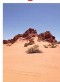
Easter Egg 36.574975, -114.534303