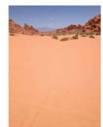
Sand Dunes 36.576955, -114.533585