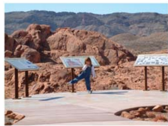
Main Restroom-Trailhead-Info Kiosks-Picnic Tables-Parking 36.593445, -114.527154