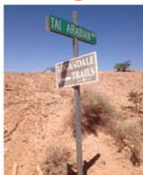
Veer left to stay on trail at Tai Arabian Ranch 36.607405, -114.495926