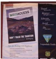
Parking, Cement Pad, Info Kiosk, Dumpsters 36.605628, -114.501478